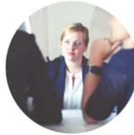
Real World scenario